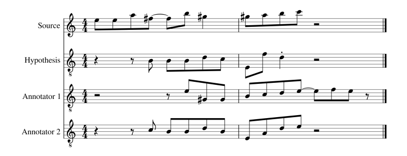
Fig. 1: From the hypothesis to a referenced-target, shown for two annotators.

1. Referenced-target : annotators are given the source sentence and the hypothesis. Based on their domain expertise, they edit directly the hypothesis until it is sufficiently appropriate as a musical complement to the source. This is, of course, a subjective judgement, however, annotators are specifically instructed to apply the minimum number of necessary edits that guarantee them a satisfactory musical result. An illustration of this procedure is shown in Figure 1.